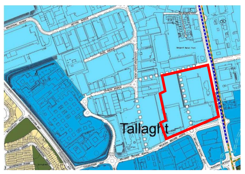
Fig. 7: Zoning Context of Subject Site

The layout of the development has been led by the strategic Roads Objective as provided by the County Development Plan which provides for a North South road bisecting the site and connecting to the future Airton Road Extension to the north of the site (in Third Party Ownership). A hierarchy of streets and public and semiprivate open space will connect to these roads and to the existing roads in the surrounding area.