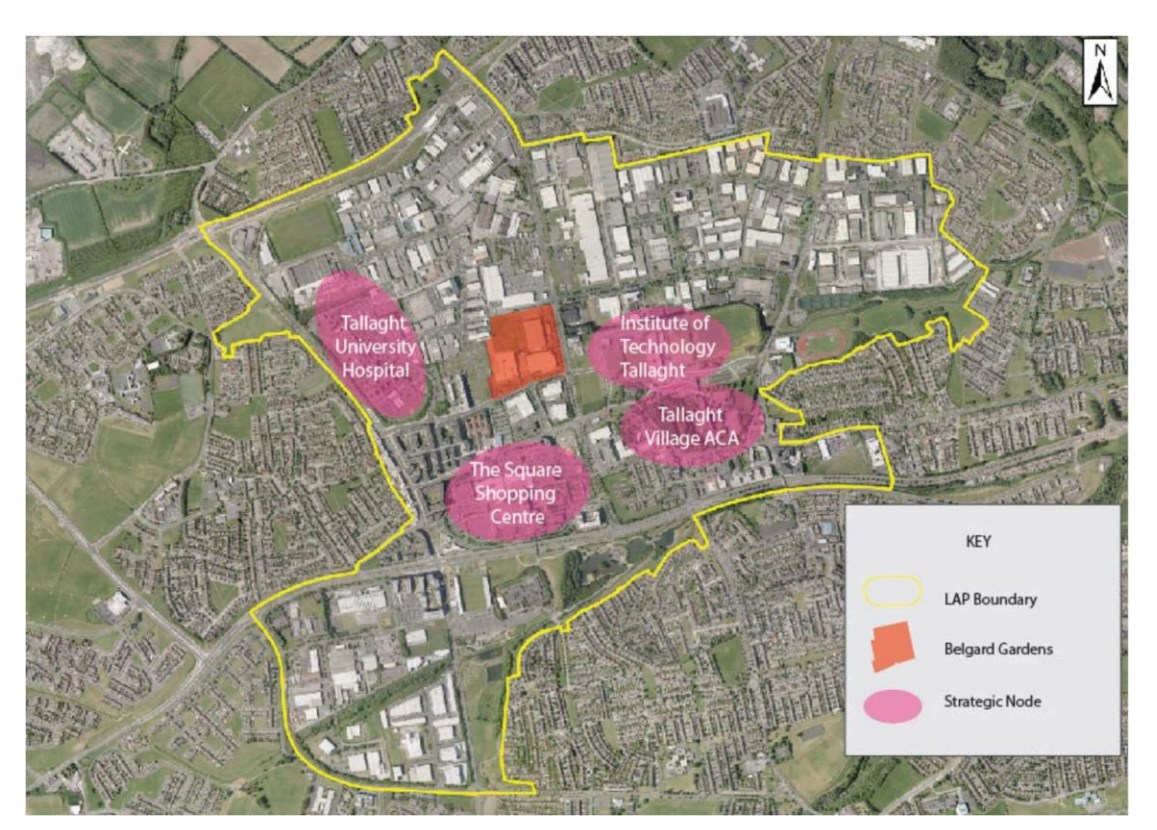
Fig. 6: Strategic context of subject site

Belgard Gardens will be a mixed use residential development located in the centre of Tallaght, which will support a socially mixed community fostered by a sense of place and belonging, and driven by excellent urban design. This development is the creation of a new area to merge with the existing neighbourhood to enhance opportunities through the construction of new homes, workplaces and retail businesses. The proposed development will support the growth of ITT, the efficient functioning of Tallaght University Hospital and the area as a whole.