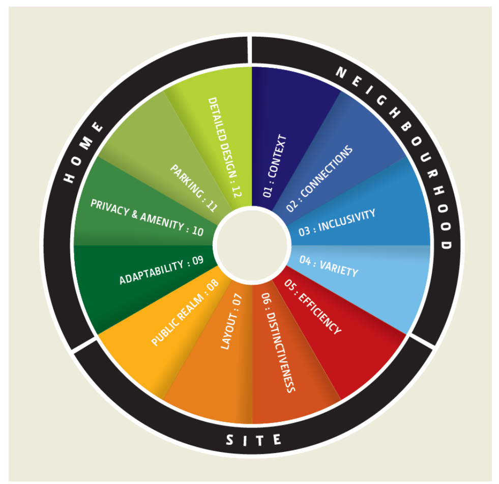
Fig. 5: 12 Design Criteria (Source: Urban Design Manual, 2009; p. 9)

This urban design guide compresses the various design features integral to good residential development into 12 no. criteria: