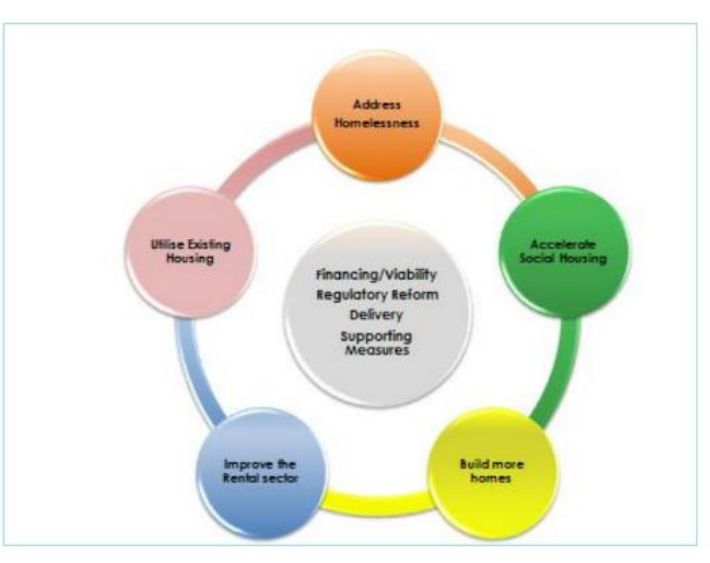
Fig. 4: Five Pillars of the Action Plan (source: Rebuilding Ireland: Action Plan for Housing and Homelessness, 2016, p. 12)

The Action provides five key Pillars which will then support a range of actions which will support the increased delivery of housing. The proposed development will directly respond to Pillar 2 of the Action Plan which seeks to 'accelerate the delivery of social housing' as 10% of units to be provided on to site will be transferred for social use as housing amounting to 44 no. dwellings.